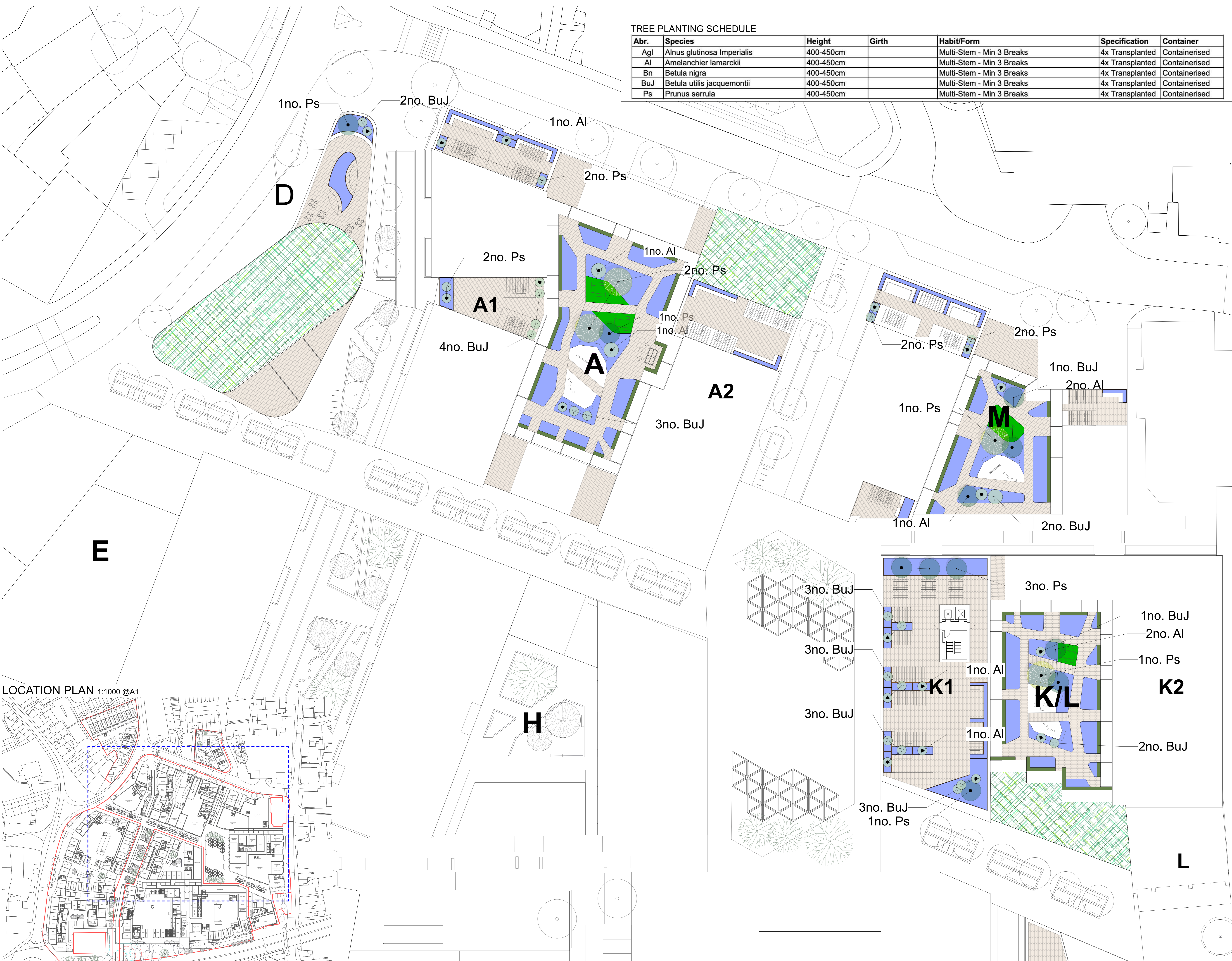
LOCATION PLAN 1:1000 @A1