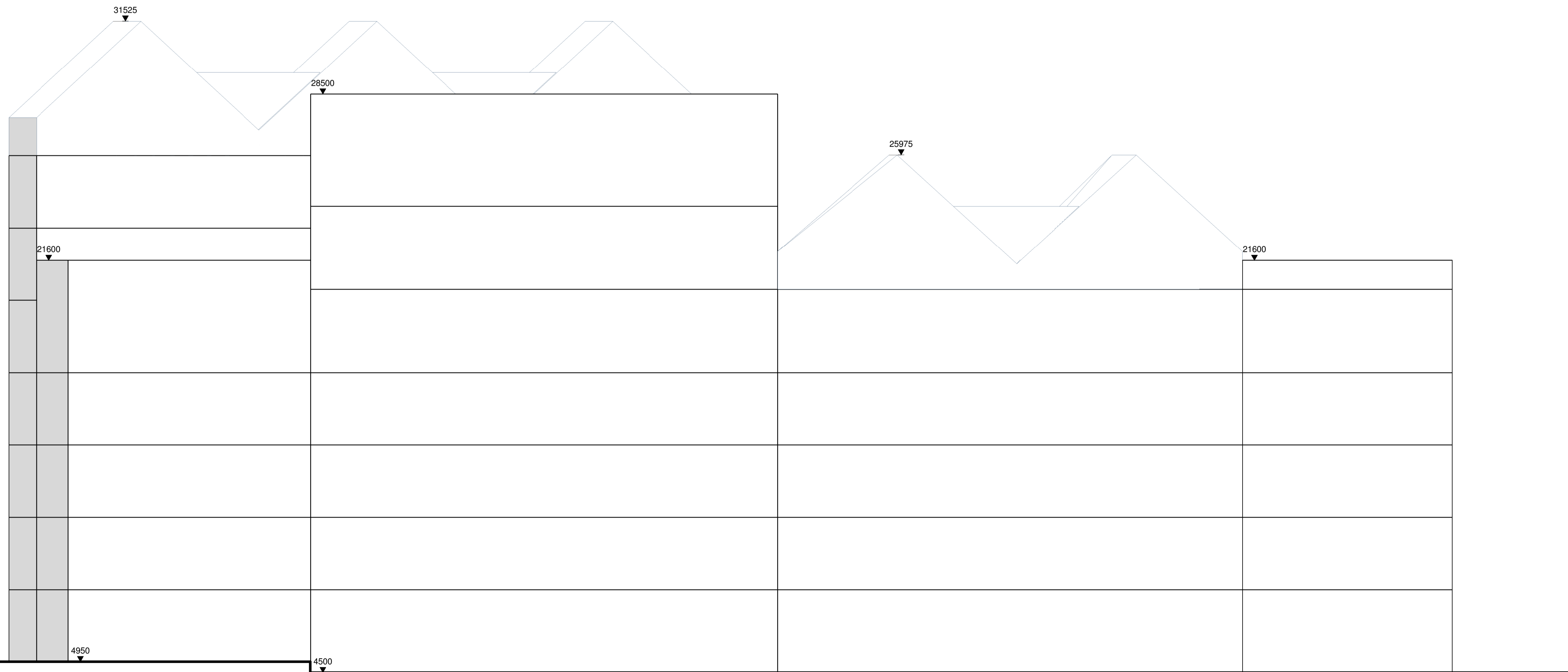
1 F - 05 - West Elevation Scale 1 : 100