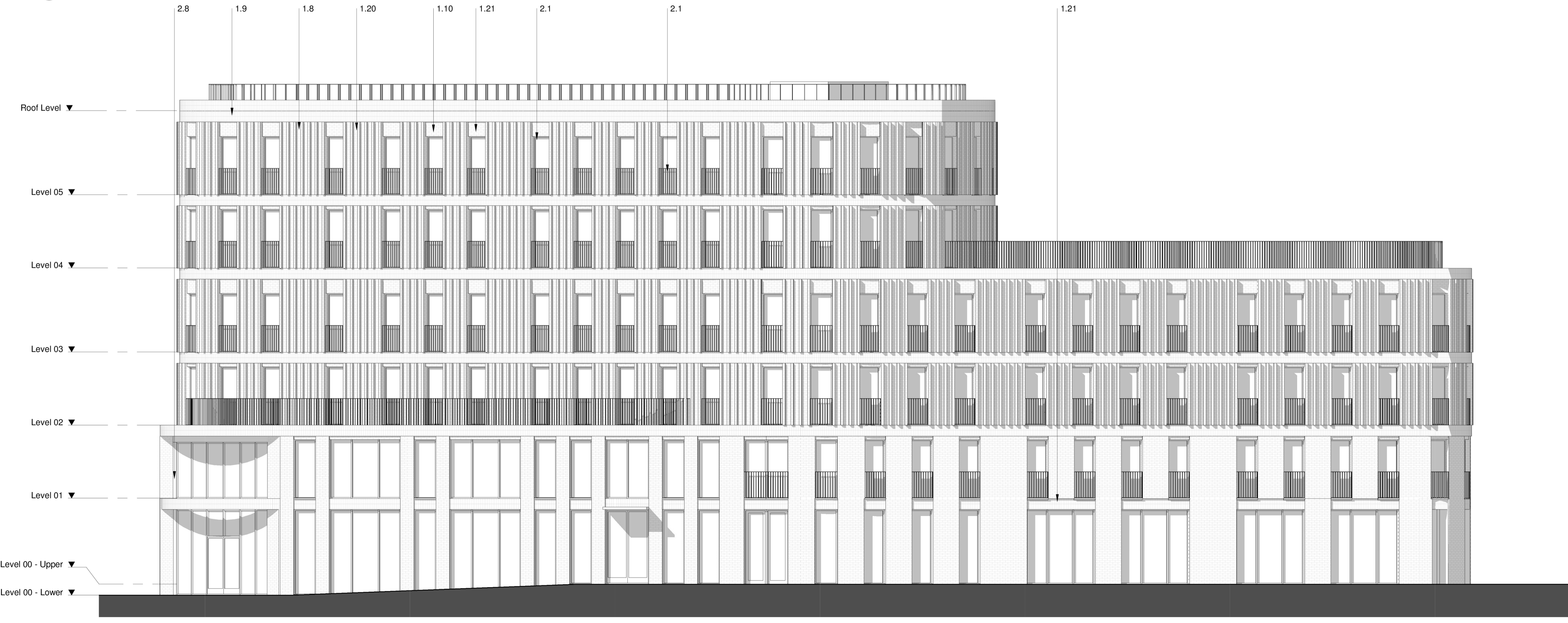
2 D - 05 - East Elevation Scale 1 : 100

Contractors and consultants are not to scale dimensions from this drawing