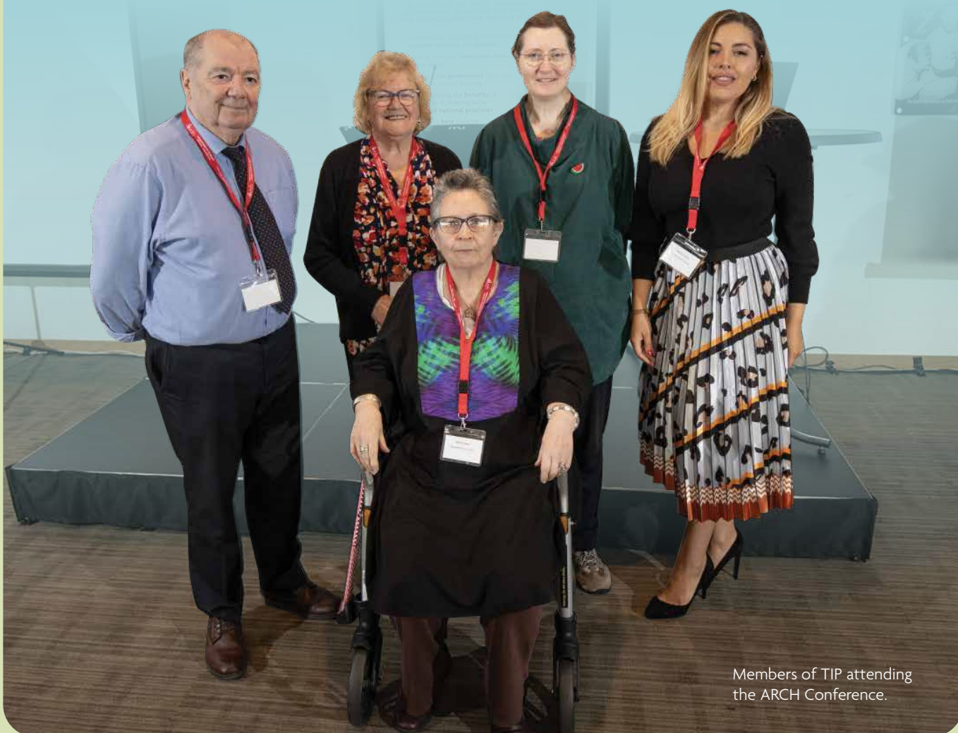
Members of TIP attending the ARCH Conference.