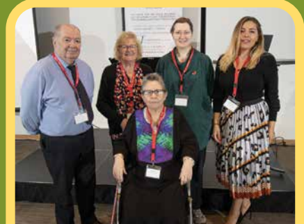
Tenant Involvement Panel Page 10