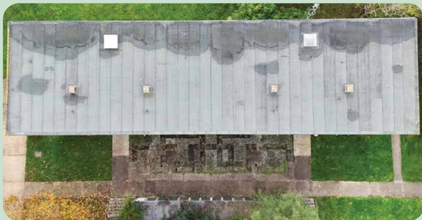
We're using drones to help us, here is a photo of Wilberforce Road showing ponding on the roof.

Thanks to past surveys, we can plan upgrades to kitchens, bathrooms, windows, doors, roofs, boilers, and electrics, making sure homes meet the Government's Decent Homes Standard.