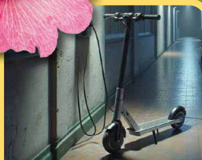
Lithium battery safety Page 6