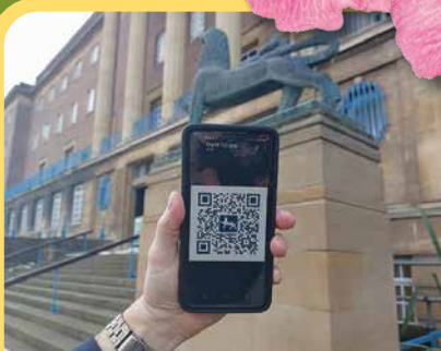
Going digital Page 3